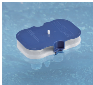
floating tube rack