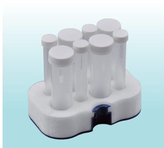
centrifuge tube rack

Jellyfish can be used as a centrifuge tube rack and also as a floating tube rack.